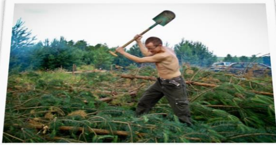
Step one: felling of trees