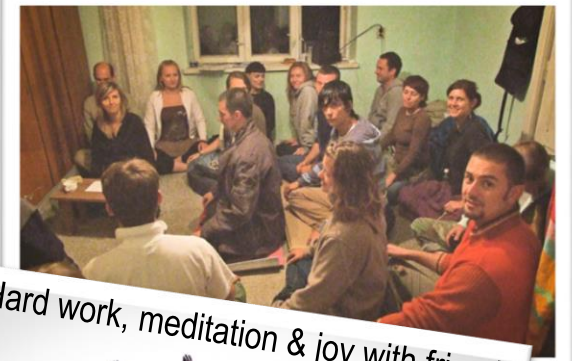
Hard work, meditation & joy with friends