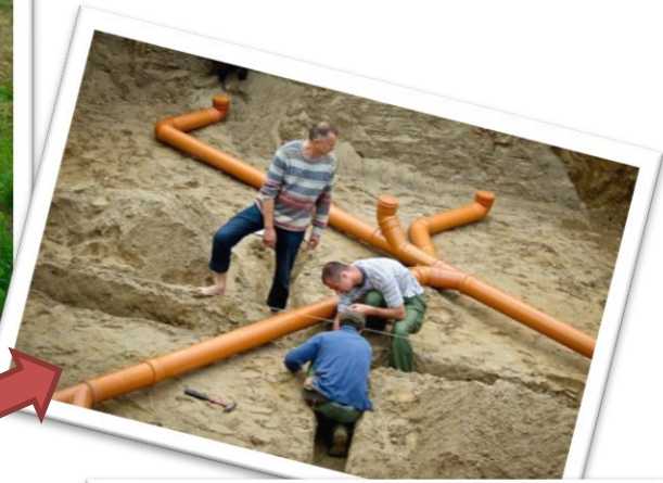
Step three: digging a large hole for the foundation